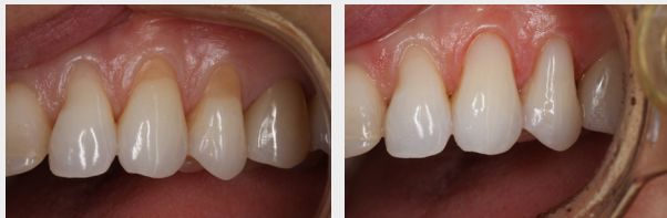
Dentistry and photography courtesy of Marc Geissberger, DDS, MA, BS, CPT

“Evanesce Flow has excellent optical properties resulting in an ideal blend with natural tooth structure.”