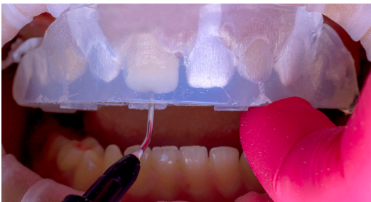
Dentistry and photography courtesy of Megan Shelton, DMD

Thixotropic for excellent control, Evanesce Flow will not slump on a vertical surface making it suitable for Class V and temporary veneer restorations.