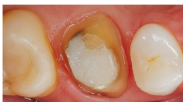
Dentistry and photography courtesy of Robert Lowe, DDS

The carboxylate resin in Cling2 is bacteriostatic, reducing gingival plaque retention and sulcus inflammation to maintain tissue health.