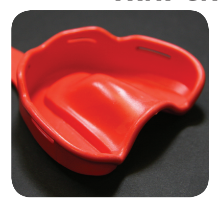
Mouldable HEATWAVE dentulous (upper) tray.