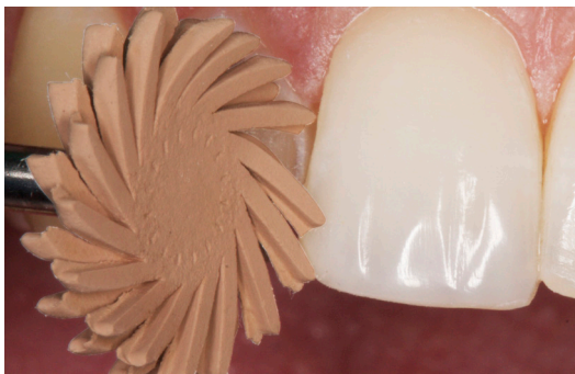
A.S.A.P. Final High Shine Polisher

Embedded with diamond particles (44 microns), the A.S.A.P. Pre-Polisher (purple) gently diminishes small surface defects, without affecting anatomy, and prepares the surface for a final high gloss polish.