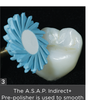
The A.S.A.P. Indirect+ Pre-polisher is used to smooth the prosthetic surface and establish an initial gloss.