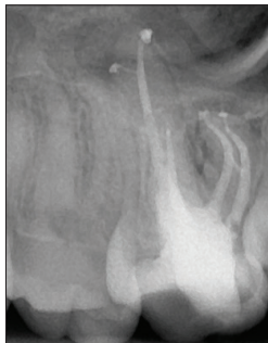
X-Plorer files greatly help in executing a reproducible glide path in complicated anatomy