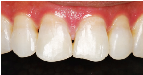
Pre-operative view showing uneven tooth wear due to pre-ortho malocclusion.

Dentistry and photography courtesy of Dr. Daniele Larose