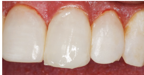
Evanesce A1 Enamel and Evanesce Fx Shade: Enamel Incisal are placed prior to finishing.