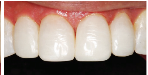
Final, polished Evanesce restoration immediately post-op.