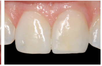
A remarkably esthetic result using only one single layer of Evanesce A1 Universal and A.S.A.P. All Surface Access Polishers. Note the perfect blending of Evanesce and tooth: the Evanesce effect.