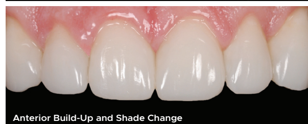
Anterior Build-Up and Shade Change