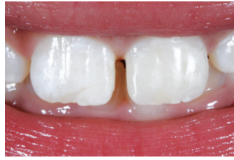
A lingual shelf built with Evanesce Enamel FX White, followed by Evanesce A2 Dentin, opaquer, and then overlaid with Evanesce A1 Enamel. (Immediately post-op: shown before tooth re-hydration.)