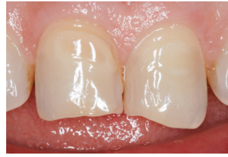
This challenging fracture case was prepared only with air abrasion prior to the application of MaxEtch 35% Phosphoric Acid Etchant and MPa Max adhesive.