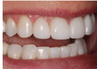
Matching composite material to porcelain is a common clinical challenge. The Evanesce range of opacities and outstanding polishability make porcelain matching cases significantly easier. Evanesce is a truly universal restorative system.

Dentistry and photography courtesy of Dr. Daniele Larose