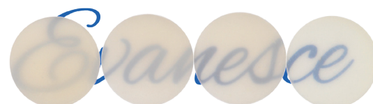
Dentin A1 (90% opacity) Universal A1 (85% opacity) Enamel A1 (80% opacity) ENAMEL FX : Enamel Clear (60% opacity)