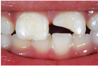
Active adolescent presents with a second Class IV fracture.