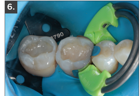
6. Evanesce composite adapts to the internal surfaces of the preparation with excellent packability.