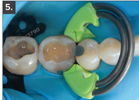
5. First increment of Evanesce Restorative material adapted to include Ultra-Wrap's pre-contoured occlusal lip, establishing an ideal rolling marginal ridge.