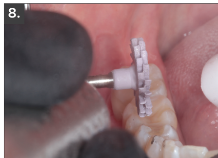
8. Diamond impregnated A.S.A.P. Pre-polisher initiates the 2 step polishing sequence in just 10-15 seconds.