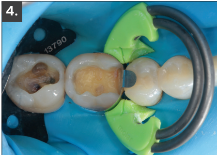
4. Once seated, the DuaForce Sectional Matrix System provides a complete gingival seal with a tight vertical seal of the matrix band along with a strong and stable separation force, resulting in less chance of composite flash.