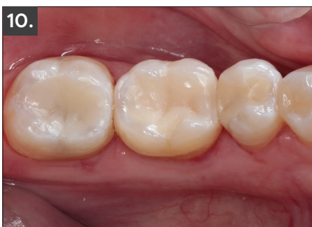
10. After just 10-15 seconds of polishing with the A.S.A.P. Final High Shine Polisher, the final esthetic restoration with an optimal proximal contact.