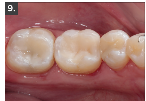
9. The A.S.A.P. Pre-polisher gently diminishes small surface defects without affecting anatomy.