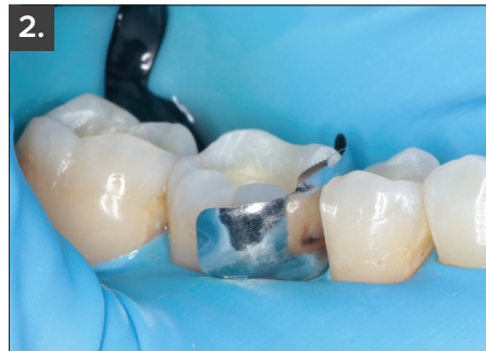
2. Ultra-Wrap matrix band in place extending well beyond the proximal line angles. Ultra-Wrap is made from .015" semi-hard stainless steel making it more resistant to crimping during placement.