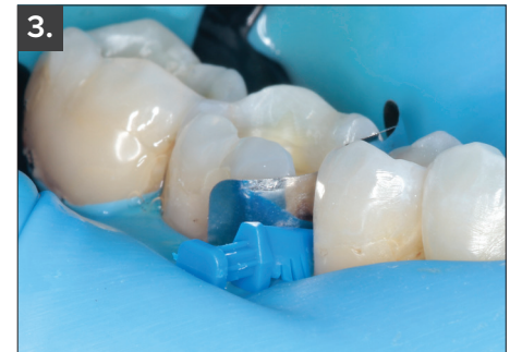
3. The Active-Wedge tip collapses during insertion for easy placement, then re-expands when fully seated, regaining full contour for an improved matrix band seal.