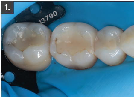
1. With rubber dam in place (Paro Non-Latex Rubber Dam), pre-op view of Wide Class II on first molar requiring replacement.