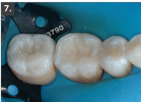
7. Evanesce is easily sculpted with no slumping, efficiently and effectively establishing the ideal occlusal anatomy before the final curing.