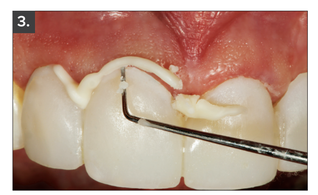
Cling2 effortlessly peels off margins.