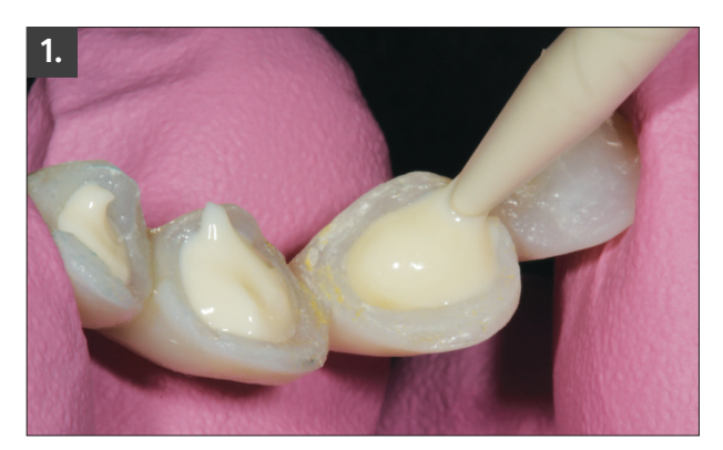
Inspire provisionals are loaded with Cling<sup>2</sup>.