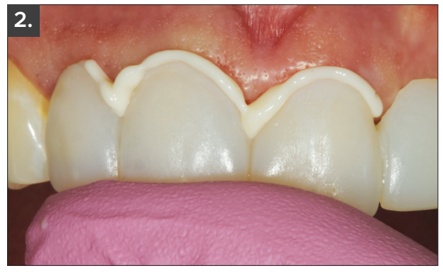
The temporary restoration is inserted and held in place for 60 to 90 seconds.